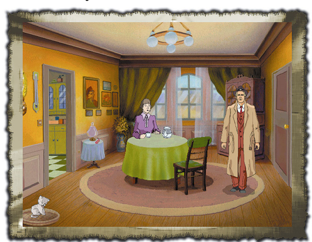
Now try to solve the riddles alone.